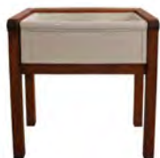
Luberon fireclay sink in French Ivory w/ 5701 Wooden Stand

The glaze fuses with the clay, resulting in a smooth, lustrous finish. The sink is then sprayed with a mixture of finely ground glass, water and cellulose binder and put into a kiln, where it is fired at 2300°F.