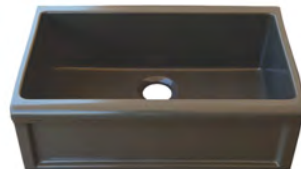
26 Sepia Brown