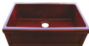
25 Red Boreal