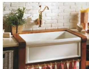
4603.20 in White