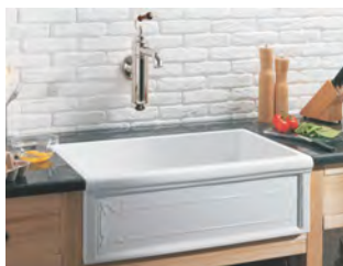
4614.20 in White