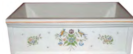
4603 "Luberon" in Moustier Polychrome (01)

* Handpaints available on 4603 & 4613 only