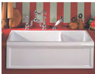
4613.20 in White