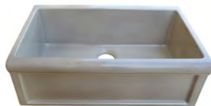
27 Caramel Beige