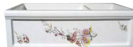
4613 "Luberon" in Avesnes (21)

Not Shown: Moustier Blue (02), Moustier Rose (03), Vieux Rouen (04), Sceau Blue (06), Berain Rose (07), Berain Vert (08), Berain Bleu (09), Romantique (10) and Rouen Marly (11).