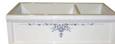
4613 "Luberon" in Berain Blue (09)