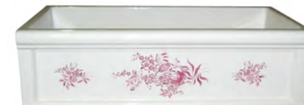
4603 "Luberon" in Sceau Rose (05)