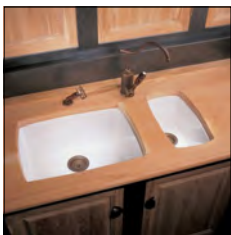
4609 20 Fireclay Drop-In Sink & 4610 20 Fireclay Prep Sink

For stubborn stains, mix together a solution of 50% bleach, 50% water, and let stand in the bottom of the sink for one hour. Drain the