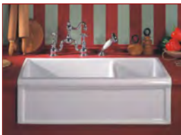
461320 Fireclay Double Sink

Herbeau fireclay sinks resist chips, stains and scratches better than cast iron or stainless steel. Stains like coffee, tea, red wine, fruit juice, etc. can be treated with a mild gel or cleanser. We recommend the "ASTONISH" brand fireclay cleaner.